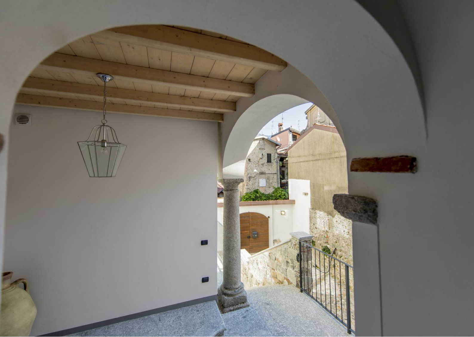
THE SOUTH FACADE PRESERVED WITH THE ORIGINAL FINISH IN RIVER STONE